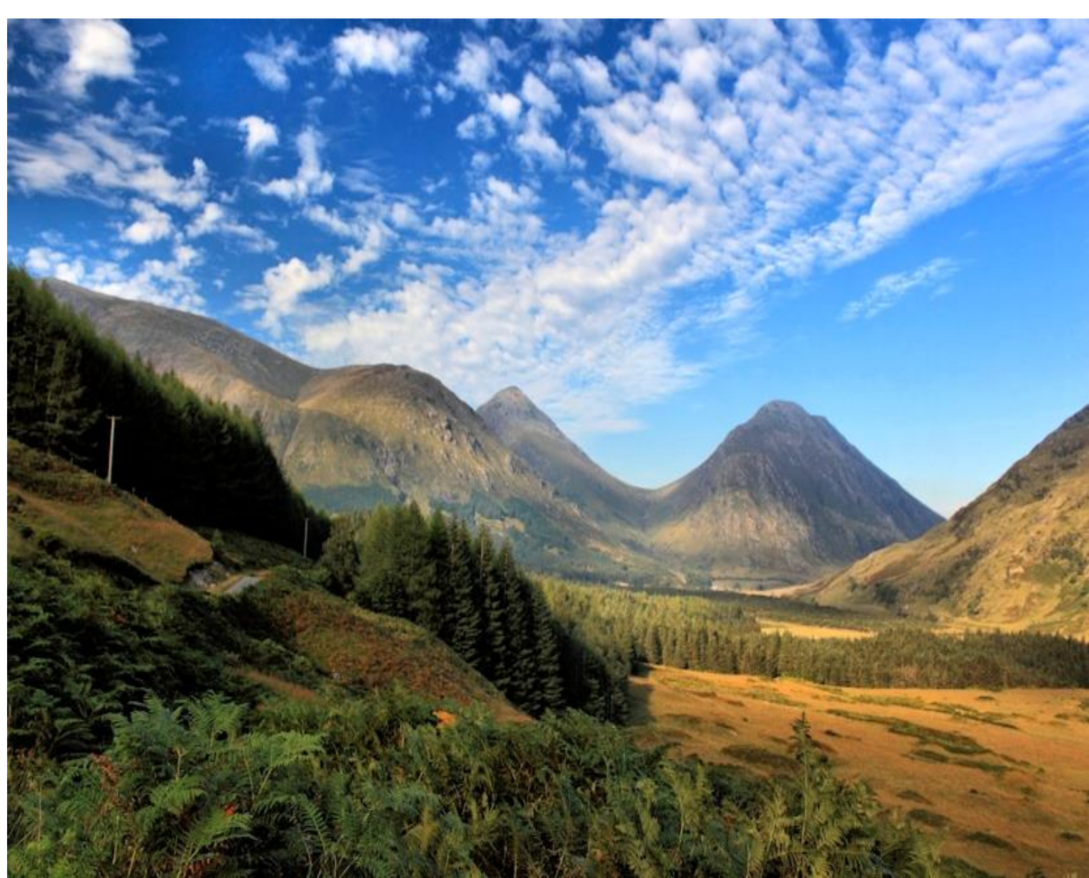
No. 1 Landscapes

Over 520 soothing images have been digitally submitted so far by people aged 21 to 78 (male 8.32%, female 88.84%, unknown 2.84%) from 23 countries. The public have rated these images for their soothability, via our website, 8689 times and completed our survey over 165 times. We have also engaged over 930 followers on social media including the First Minister of Scotland. The top 5 themes of images submitted are highlighted below: