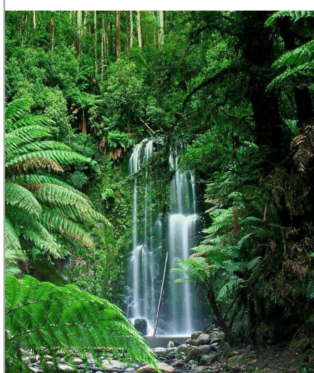
No. 2 Water Features