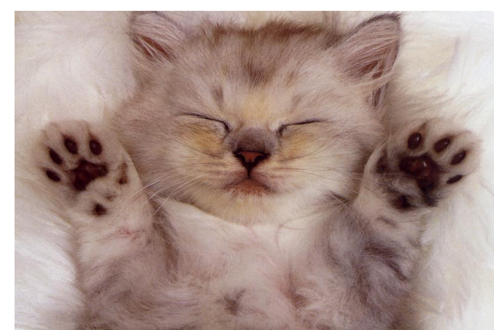
No. 4 Animals